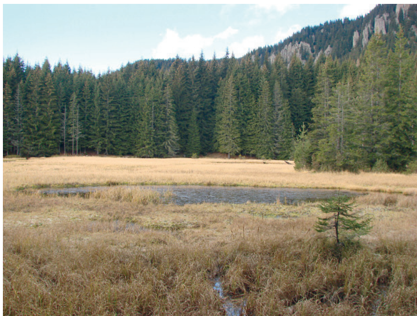
Fig. 2. A view of Lake Blatisto in 2012.

P. sylvestris and Juniperus communis L. Remarkable are the enormous, still growing Sphagnum islands which occupy nearly 60% of the lake surface (Fig. 2). Between the islands and the borders of the lake the vegetation consists of Carex acuta L., C. echinata Murr., C. rostrata Stokes, Juncus effusus L., Eleocharis palustris (L.) R. Br., Equisetum hiemale L., E. fluviatile L. Mentha aquatica L., Hypericum tetrapterum Fries, Menyanthes trifoliata L., etc. The surrounding meadows are dominated by grasses and scattered stands of P. sylvestris , Betula pendula Roth. and J. communis . The present-day vegetation composition in the area of the lakes has been in-